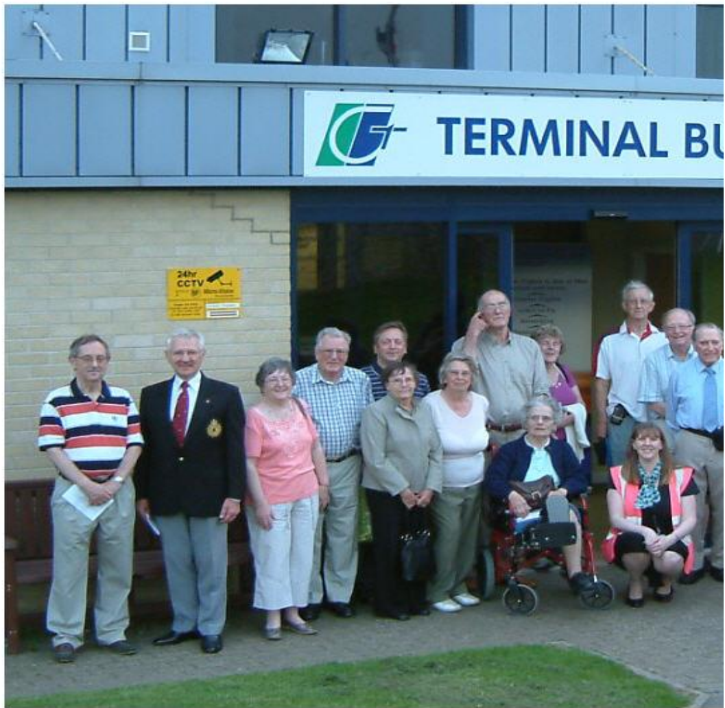
(taken on Wednesday May 23 rd 2012)