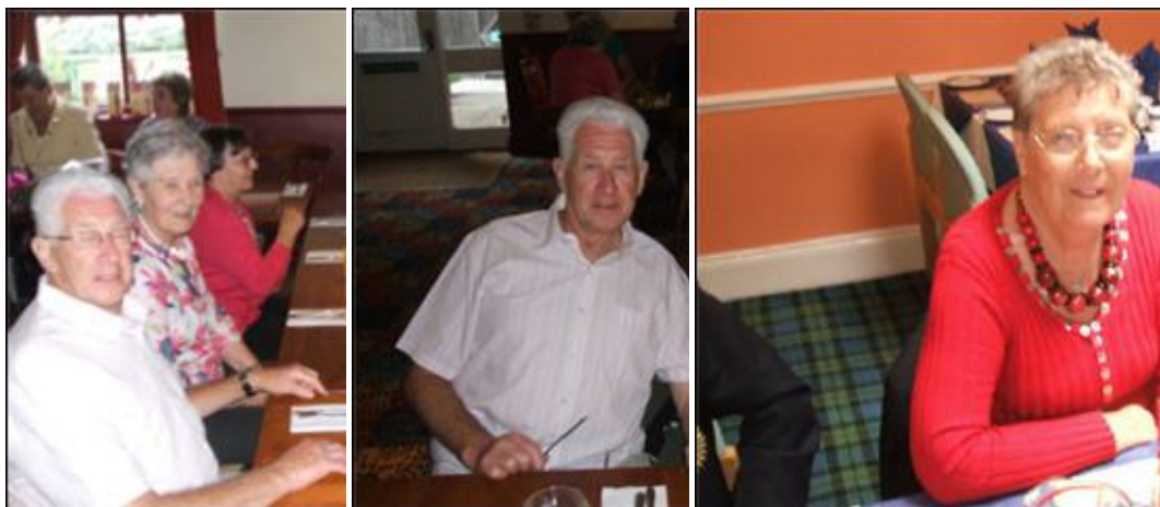
Memories of our attendance at this year's event held over the weekend June 21 st - 24 th 2013