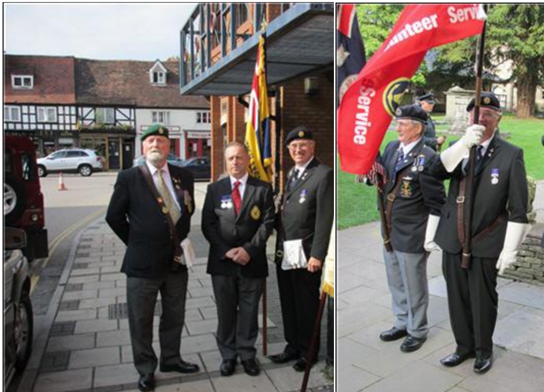
First Wednesday (September 2014) Lunch - Thornbury