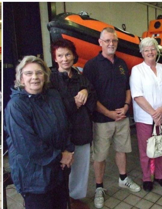
Smiles all around