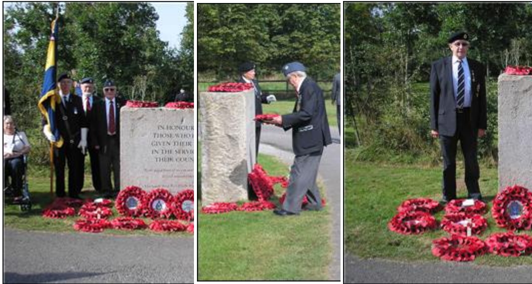
Tewkesbury Parade September 21st 2014