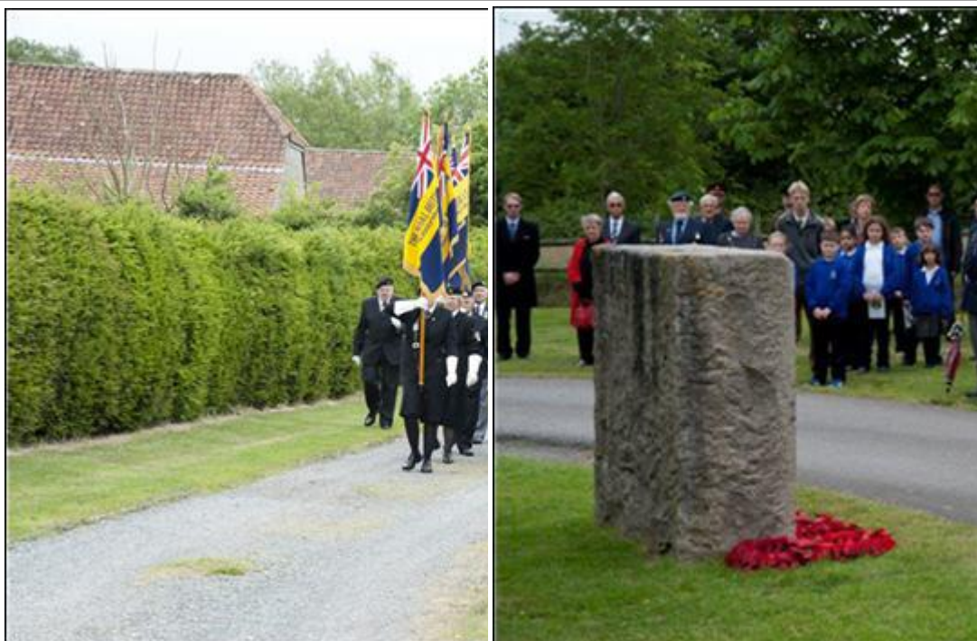
Taken on Wednesday June 17th 2015