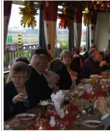
Visit to Sharpness SARA Aug 16 th 2012