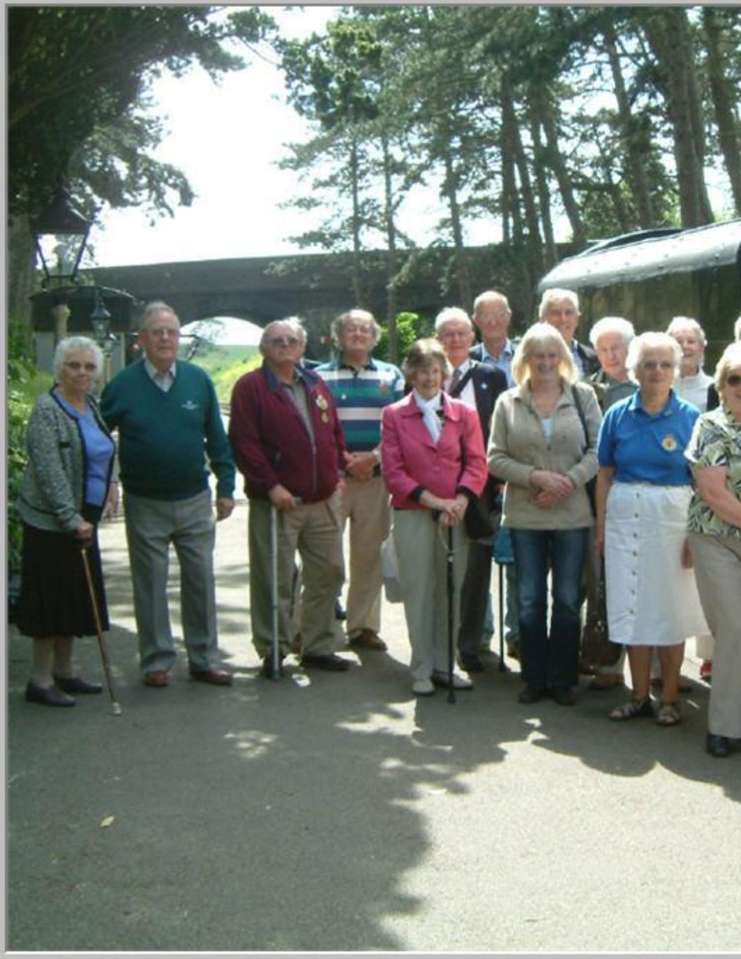
Taken on Cheltenham Racecourse Station platform.