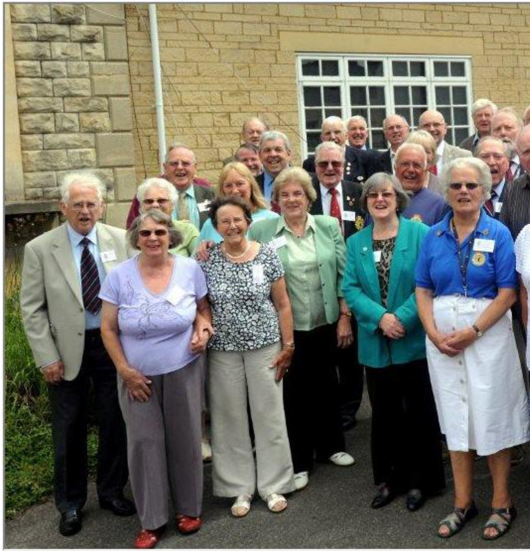
Group photo taken outside the Conservative Club Stroud. July 3rd 2013