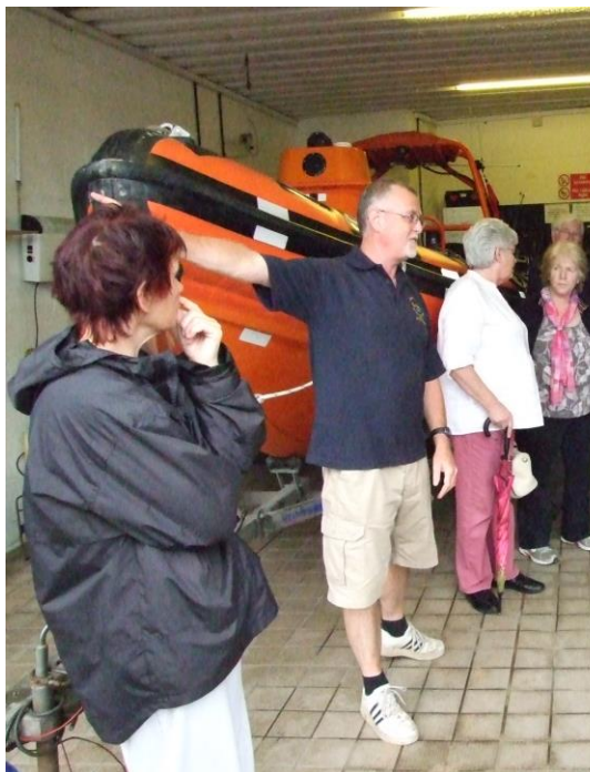
Hanging on every word...