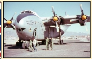
Royal Air Force